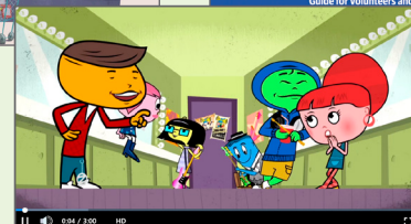
Cha-Ching Music Videos